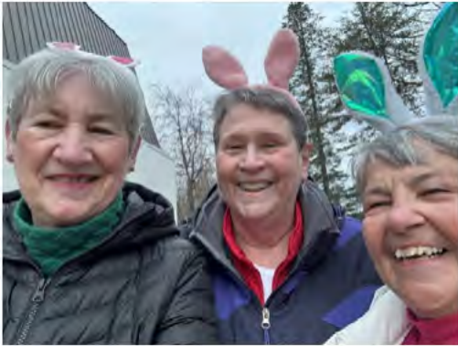
Hopping Down the Bunny Trail

Another year of Easter fun at Park Forest Pre-school is in the books.